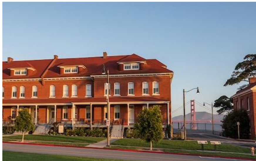
Lodge at the Presidio is the closest hotel to the famous Golden Gate Bridge.