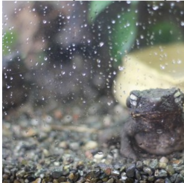
California Academy of Sciences.