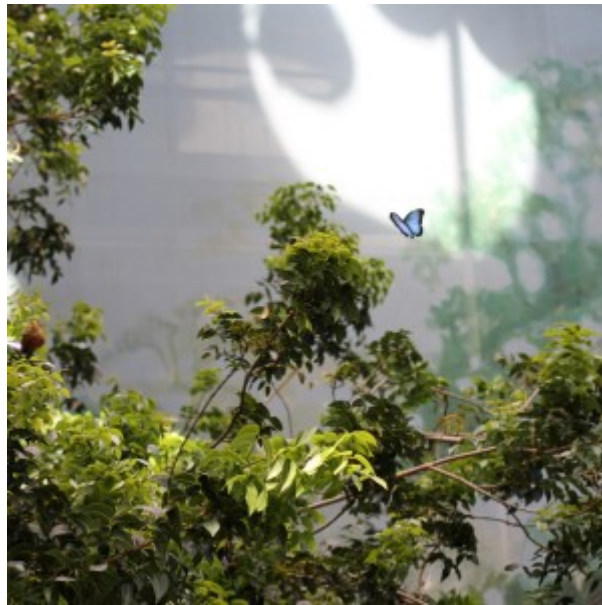
California Academy of Sciences.

We chose to take the scenic route home, over the Golden Gate Bridge. If you have the time, and courage, take a walk over the bridge. You'll have your breath taken away not only by the height above the water (don't look down) but also by the absolutely incredible and almost all-inclusive view of San Francisco. The beauty and charm of the city is prominent; it's no wonder travelers from all over the world list it as a top destination.