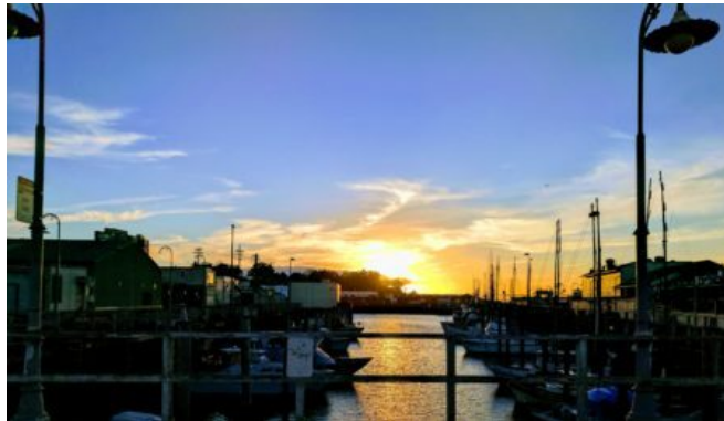
Dinner on the wharf.

Our evening continued, by trolley, to dinner down on Fishermen's Wharf. After getting off at Ghirardelli Square (foreshadowing, we'll end up there later), a short walk to the wharf led us to Scoma's on the water. The rather tiny building is always packed, and we were lucky enough to secure a table by the window. Watching the calm water and eating fresh fish transported us to a different San Francisco. We enjoyed our dinner and each other's company while admiring the quiet bay.