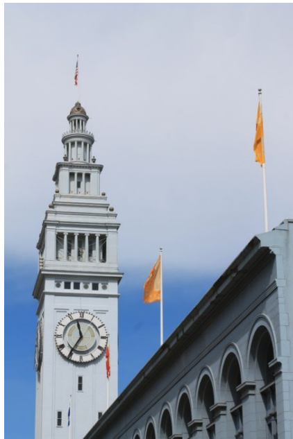
Ferry Building.

We had to pass by the park, no baseball that day, but ventured on to 21st Amendment Brewery. I always promise my boyfriend good beer when we travel – and that’s exactly what is offered at 21st Amendment. If you haven’t tried their Hell Or High Watermelon wheat beer yet, you’re missing out. It is unbelievably refreshing, and even though you can pick up a 6-pack at the store, nothing beats a beer fresh out of the tap. Their Brew Free! Or Die IPA is a great pick for those who prefer more hops, and El Sully is a smooth Mexican-style lager.