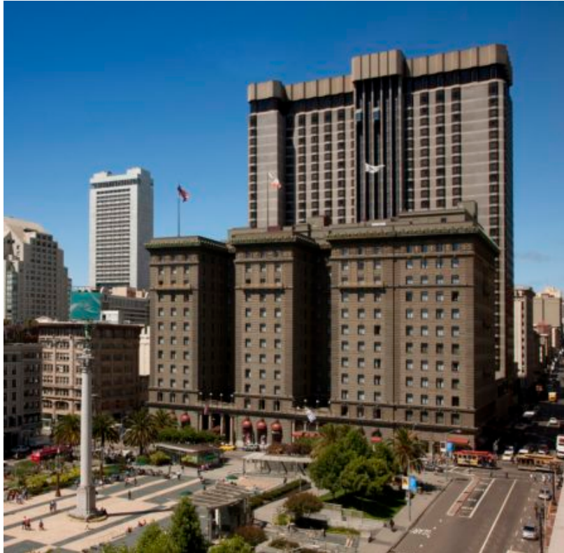
The Westin St. Francis.

San Francisco is a desirable destination for travelers near and far, but visitors can easily become overwhelmed by the fast pace of the city. How else do you expect over 850,000 people to fit in just under 49 square miles? People need to move and they like to move fast!