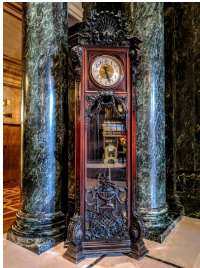
The infamous Clock Bar clock.

Our evening continued, by trolley, to dinner down on Fishermen's Wharf. After getting off at Ghirardelli Square (foreshadowing, we'll end up there later), a short walk to the wharf led us to Scoma's on the water. The rather tiny building is always packed, and we were lucky enough to secure a table by the window. Watching the calm water and eating fresh fish transported us to a different San Francisco. We enjoyed our dinner and each other's company while admiring the quiet bay.