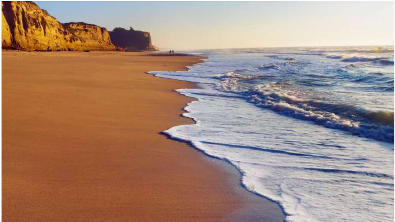
Lap it up: Half Moon Bay

I remember, once, on Baddiel and Skinner Unplanned, bringing up a trip I'd made to Sydney and talking fondly of cuddling a koala. Frank turned to camera and said: "Koala bears — they've got chlamydia. Sorry, koalas, but it's out there now: deal with it." It made me laugh, but it did somewhat puncture my ideal of that species. So, let me warn you, I may be about to puncture your ideal of something else that appears absolutely lovely in photographs: San Francisco.