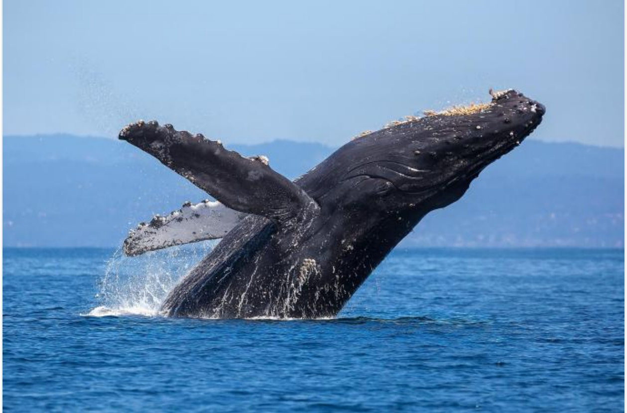
A humpback puts on a show in the Pacific

It seemed to be putting on a show just for us (it wasn't: it was calling to other whales to let them know that fish were plentiful in this spot), rolling and singing and dancing across the waves for as long as it took for all on board to film it. It was breathtaking. Half an hour later, we were returning to Pier 39 under the Golden Gate Bridge and the sun, once again, was blazing.