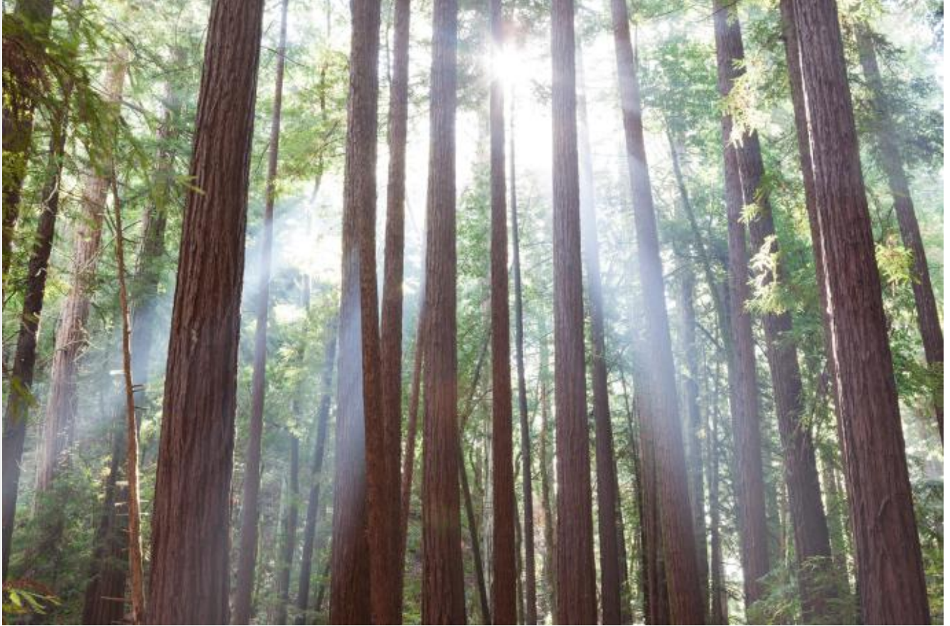
Big trees in the Armstrong Redwoods State Natural Reserve

We got a table at River's End, the one restaurant overlooking the sea, and ate fresh fish (well, not my daughter, she's a vegan, and not my son, who insisted on a burger, and actually my wife is basically vegetarian now — OK, I ate fresh fish) with an uninterrupted view of a shimmering sunset.